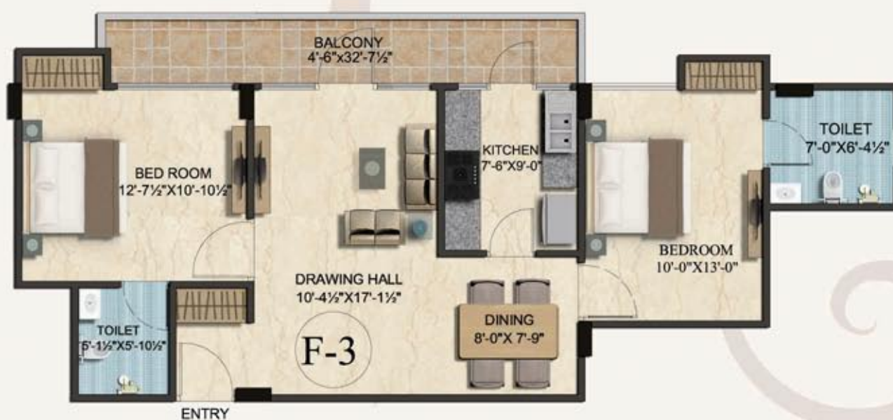
FLAT F3 PLAN