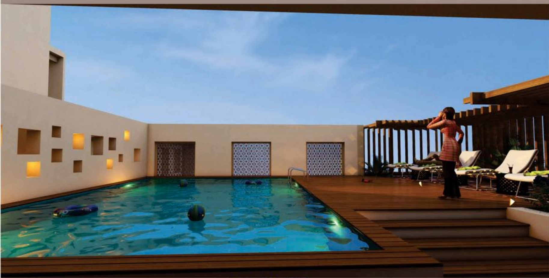
pool side VIEW