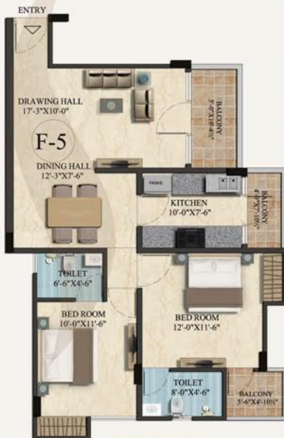
FLAT F5 PLAN