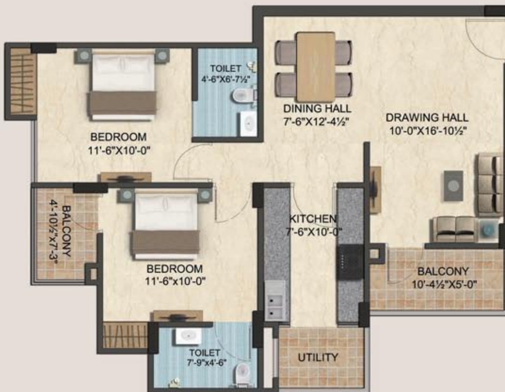
FLAT F1 PLAN