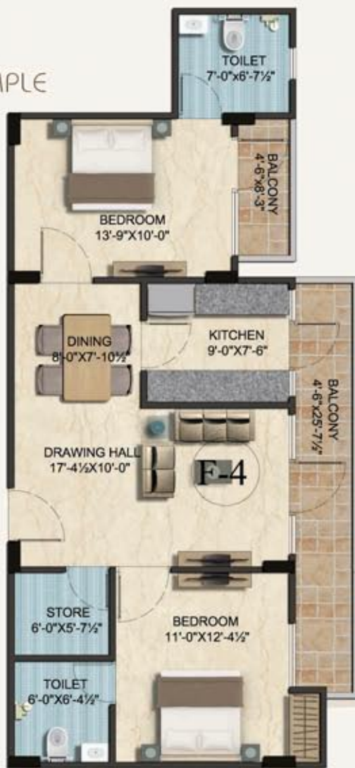
FLAT F4 PLAN