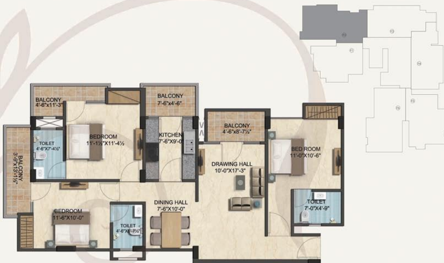
FLAT F2 PLAN