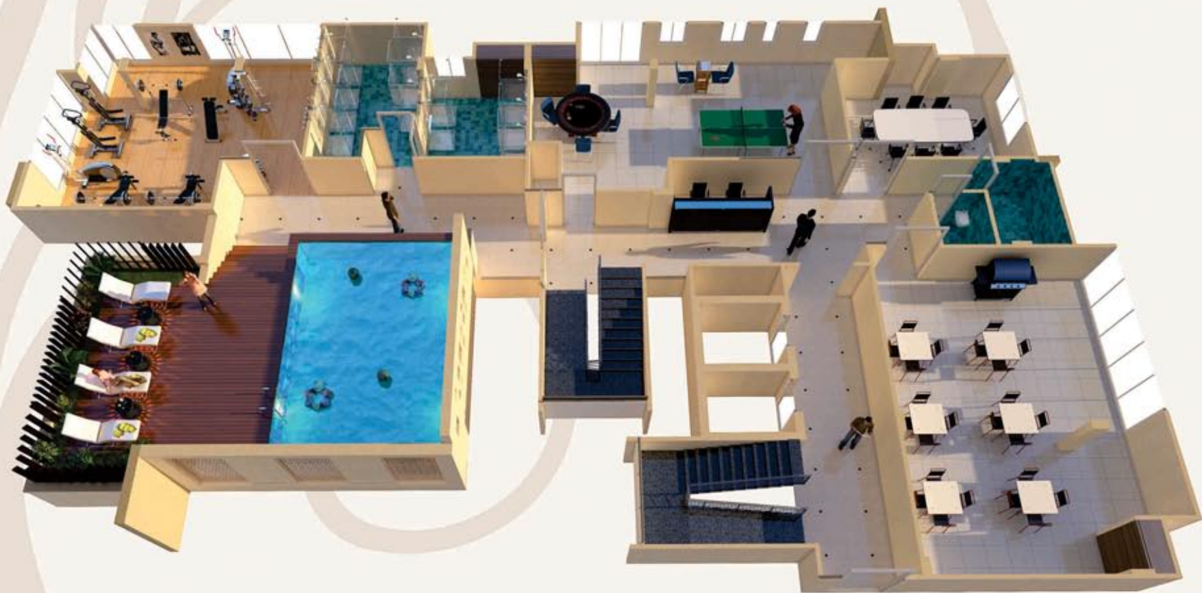
TERRACE ISOMETRIC VIEW