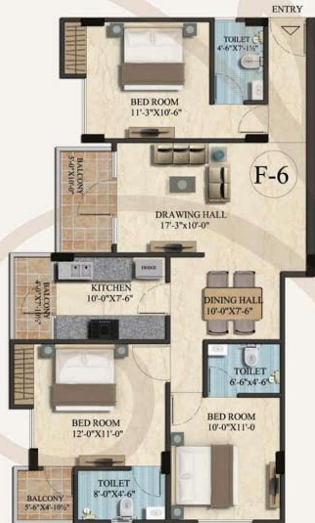
FLAT F6 PLAN